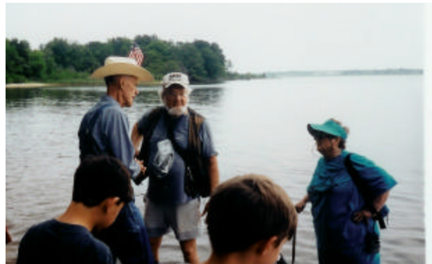
Lacking photo from 2004, we use one from 2002