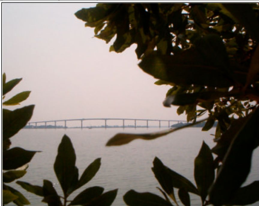
View of Bridge from Park

We'll have water or lemonade and a membership table with brochures and maps. Bring your own picnic! In preparation for the day, we'll have a trail weed clearing on Wednesday, June 23rd at 4:30. If you'd like to help with something on the day, contact Bill Burruss at 301-373-8305.