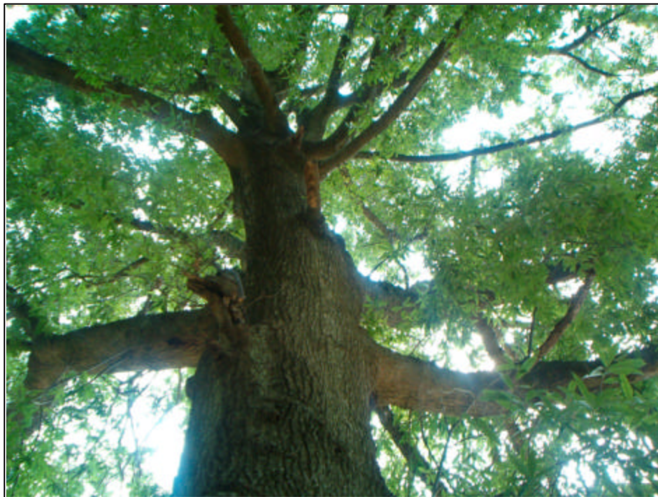
MPP Great Willow Oak near Waterfront Entrance